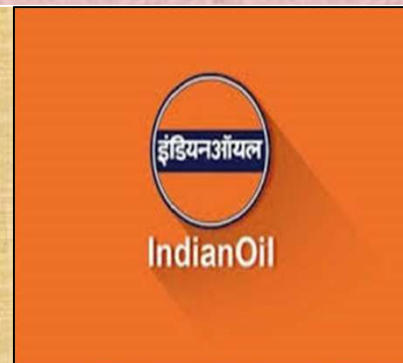
INDIAN OIL CORPORATION