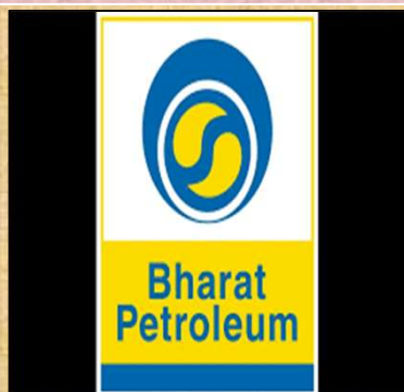
BHARAT PETROLEUM CORPORATION LIMITED