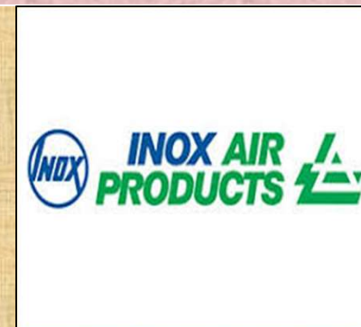
INOX AIR PRODUCTS

Because Every Heart Deserves a Chance to Beat